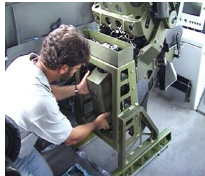
Figure 4. Rear View of Suspended Seat With Removable Isolator Cover