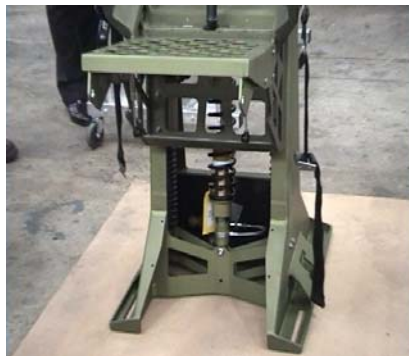
Figure 3. Sub-Assembly of Suspended Seat With Shock Isolator

The Mk V SOC seat itself is a current design of STIDD Systems, Inc. of Greenport, New York. Previous efforts to provide some level of isolation to the seat have resulted in the current design that consists of a seat base rigidly mounted to the deck and a suspended seat portion guided by twin rails with linear ball bushing bearings. The Shock Isolator, designed and manufactured by Taylor Devices, Inc., provides the required spring and energy absorption, along with the adaptive attributes as dictated by the analysis outlined above. Figure 3 and Figure 4 illustrate the suspended seat.